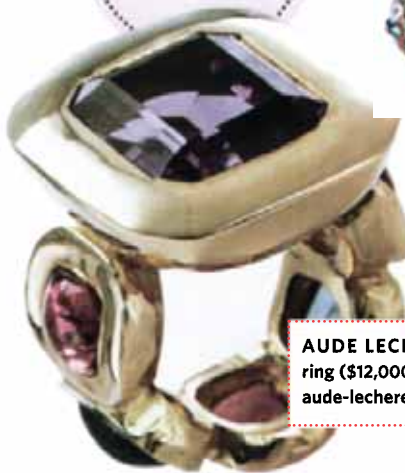
AUDE LECHÈRE ring ($12,000), aude-lechere.com.