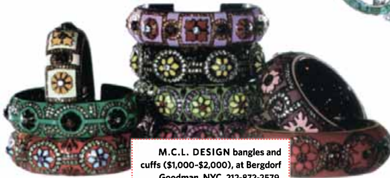
M.C.L. DESIGN bangles and cuffs ($1,000-$2,000), at Bergdorf Goodman, NYC, 212-872-2579.